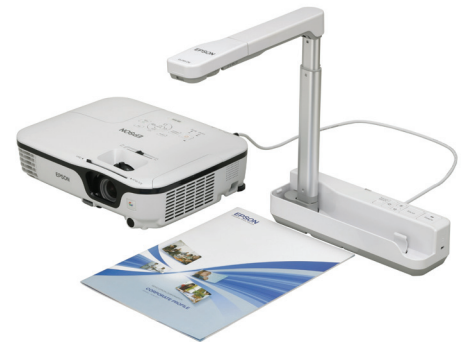
Share 3D objects using the ELPDC06 USB visualiser